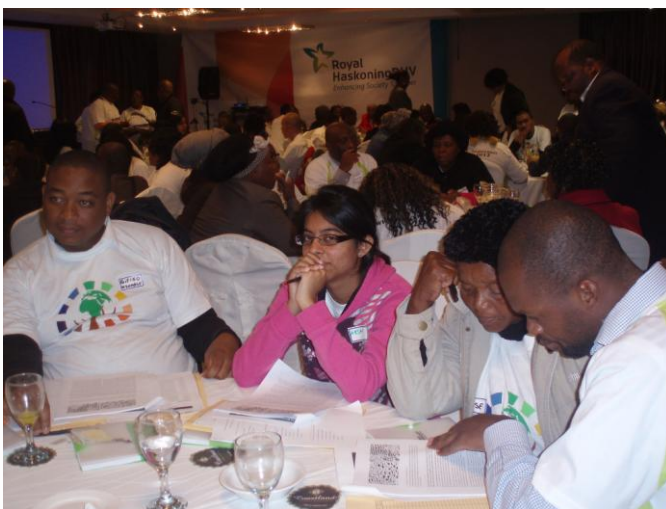
South Africa: At the citizen meeting in South Africa the citizens consisted of grade 11 learners, university students with interest in agriculture as well as environmental issues, Royal Haskonian, traditional healers, Sangomas, fishermen, farmers and other concerned citizens.