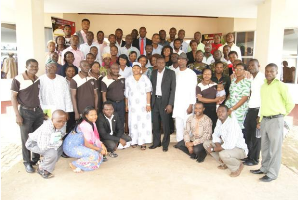
Nigeria: The participating citizens at the citizen meeting in Nigeria are gathered for a group photo.

Washington – USA: The voting process at the citizen meeting in Washington, USA. 50% of the citizens in Washington would chose to reduce the demand for more food, for example by eating more plants and less meat as the most promising general strategy in matching the future demand for food with the aim to protect biodiversity, while only 29.3% of the citizens of the world answered the same.